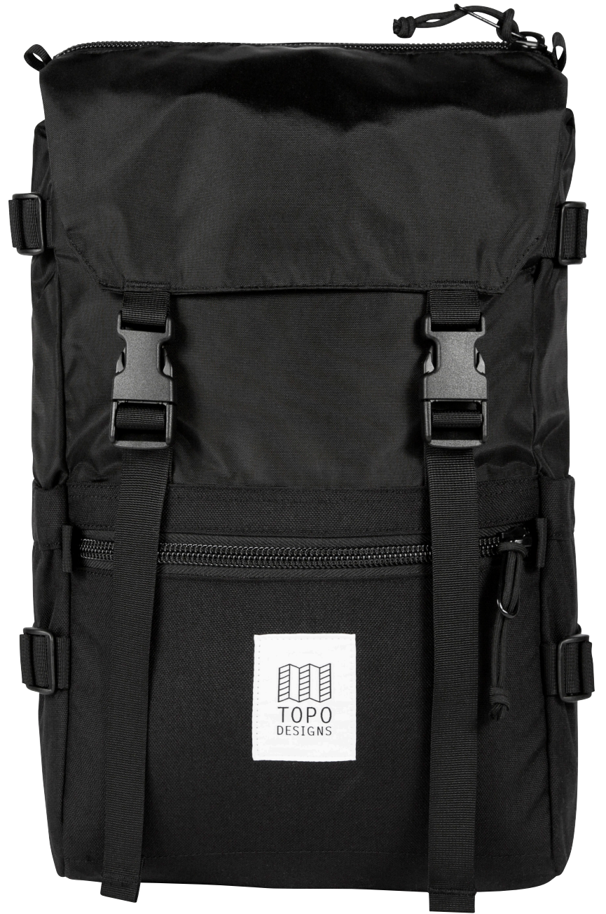
ROVER PACK - BLACK / BLACK