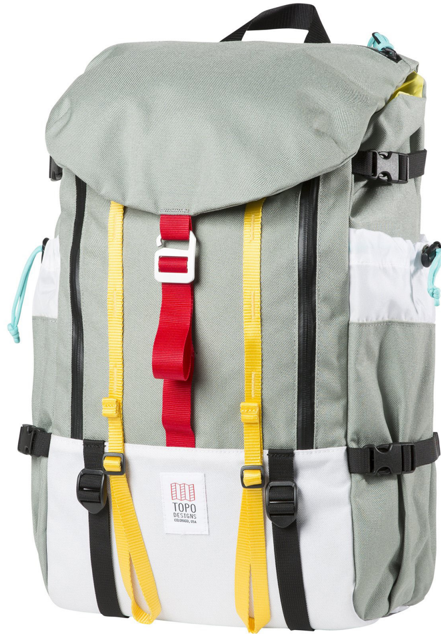
MOUNTAIN PACK - SILVER