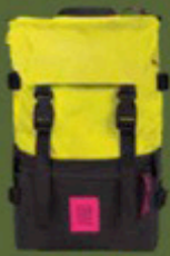
Rover Pack CLASSIC