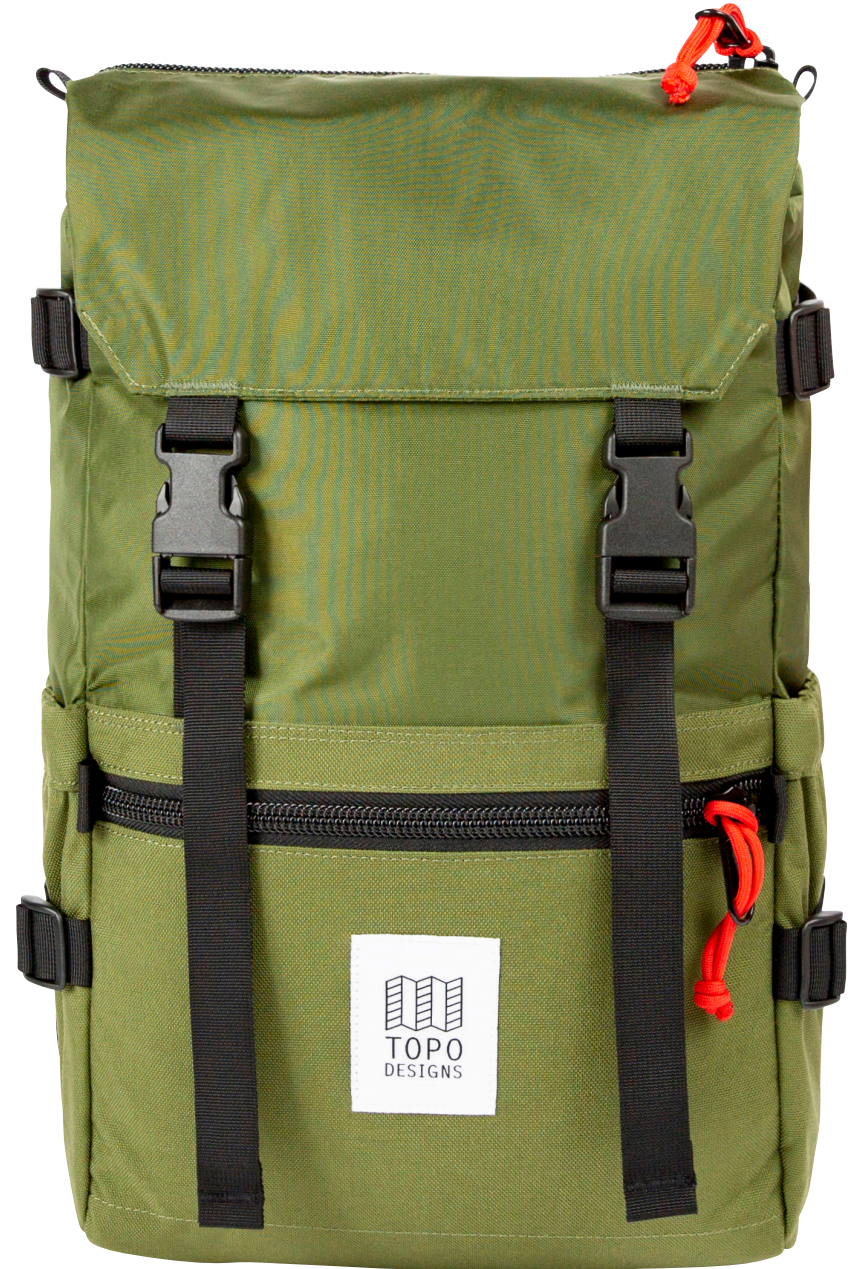
ROVER PACK - OLIVE / OLIVE