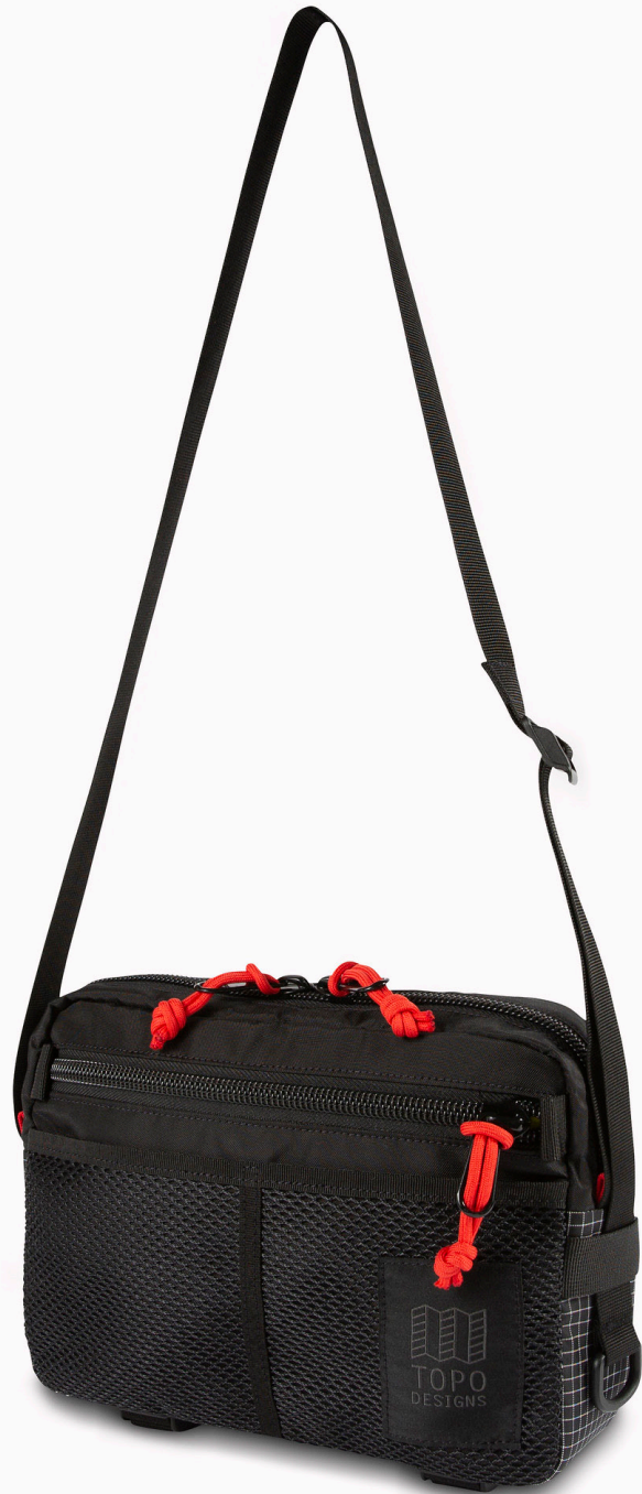
BLOCK BAG - BLACK