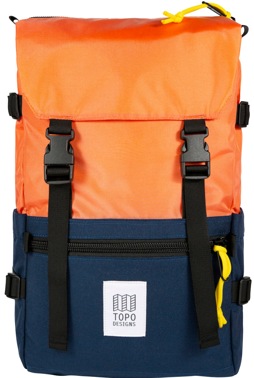
ROVER PACK - CORAL / NAVY