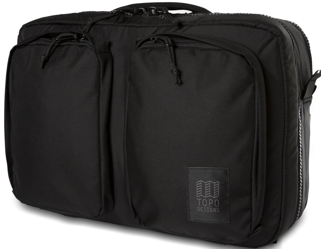
GLOBAL BRIEFCASE - 3-DAY - BALLISTIC BLACK