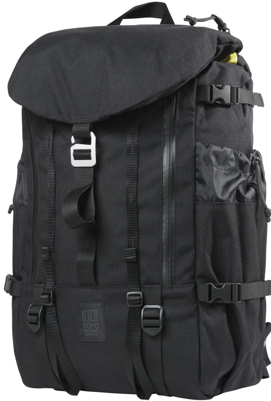
MOUNTAIN PACK - BLACK