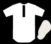
PackFast™ PACKING BAND