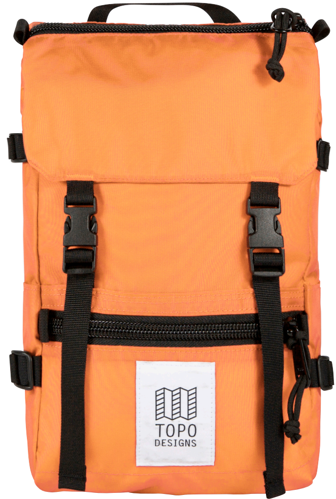
ROVER PACK - CORAL / CORAL