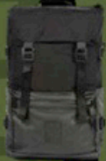
Rover Pack PREMIUM