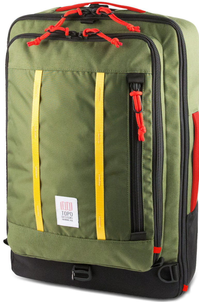
TRAVEL BAG - 30L - OLIVE/RED