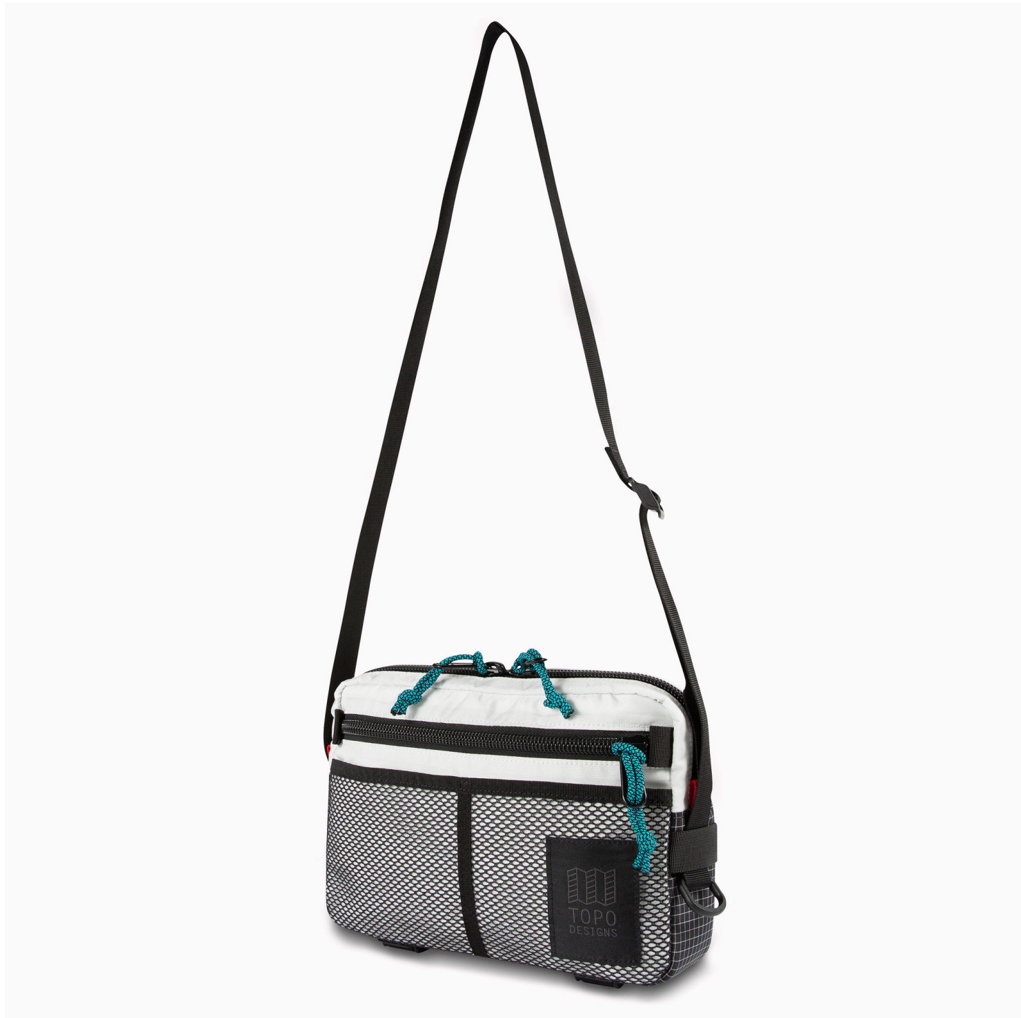
BLOCK BAG - WHITE