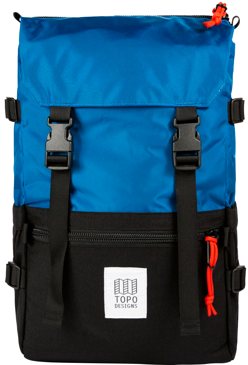
ROVER PACK - BLUE / BLACK