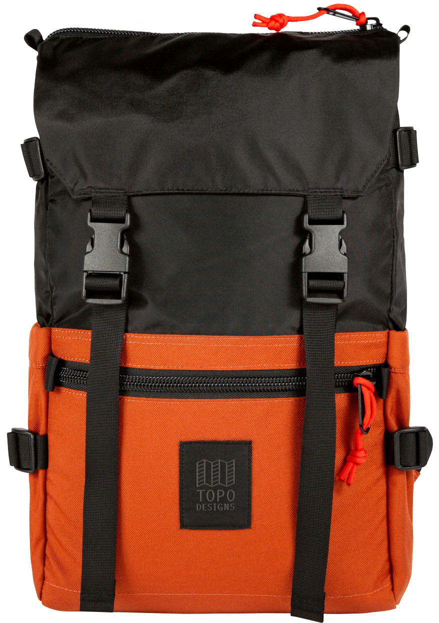
ROVER PACK - BLACK / CLAY