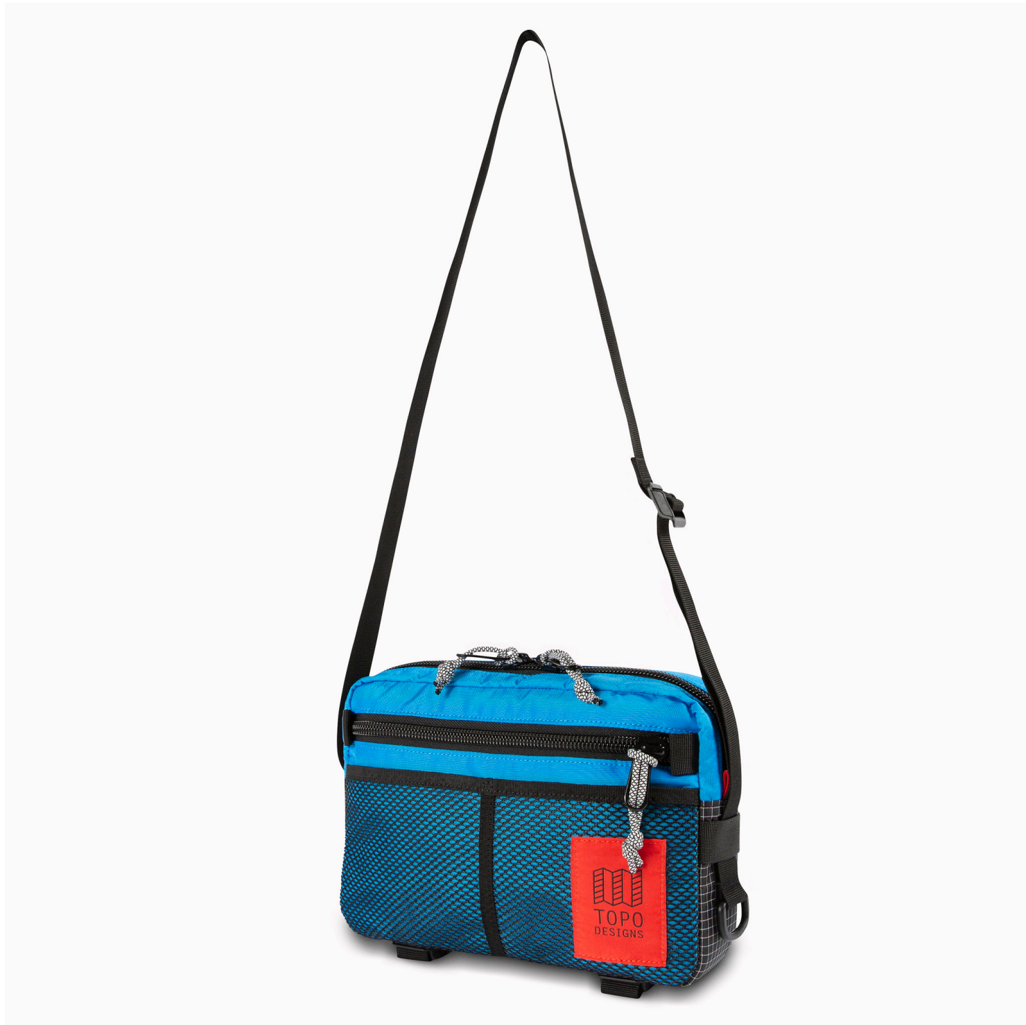
BLOCK BAG - BLUE