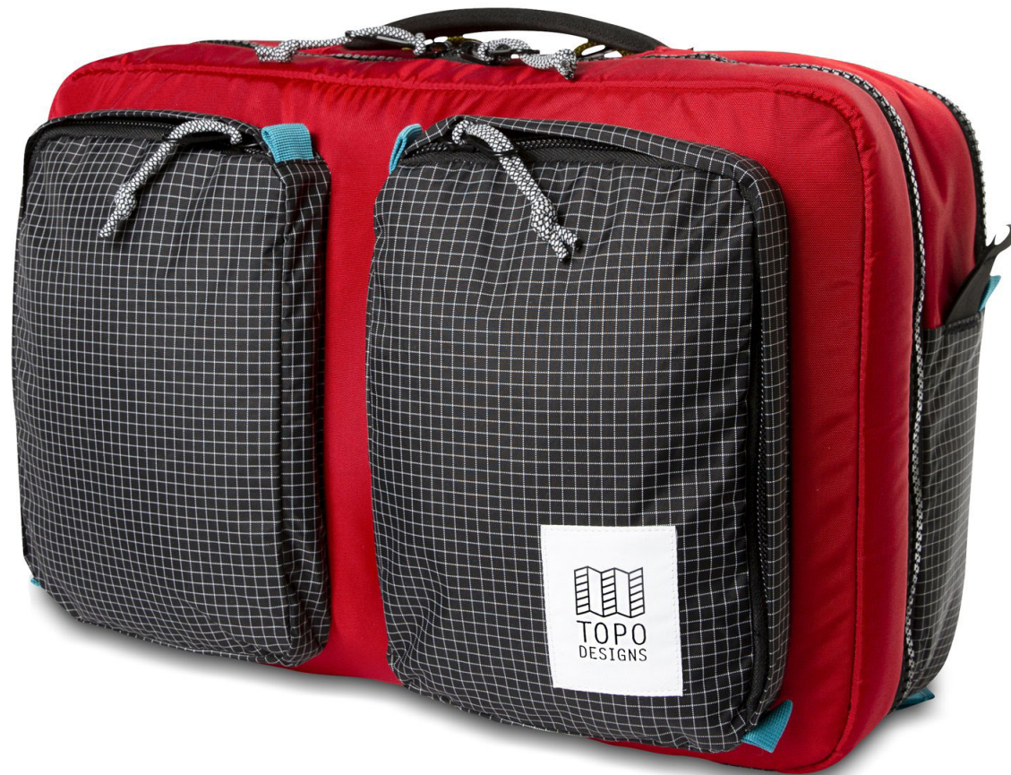
GLOBAL BRIEFCASE - 3-DAY - RED/BLACK RIPSTOP