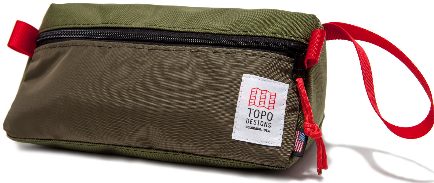
DOPP KIT - OLIVE