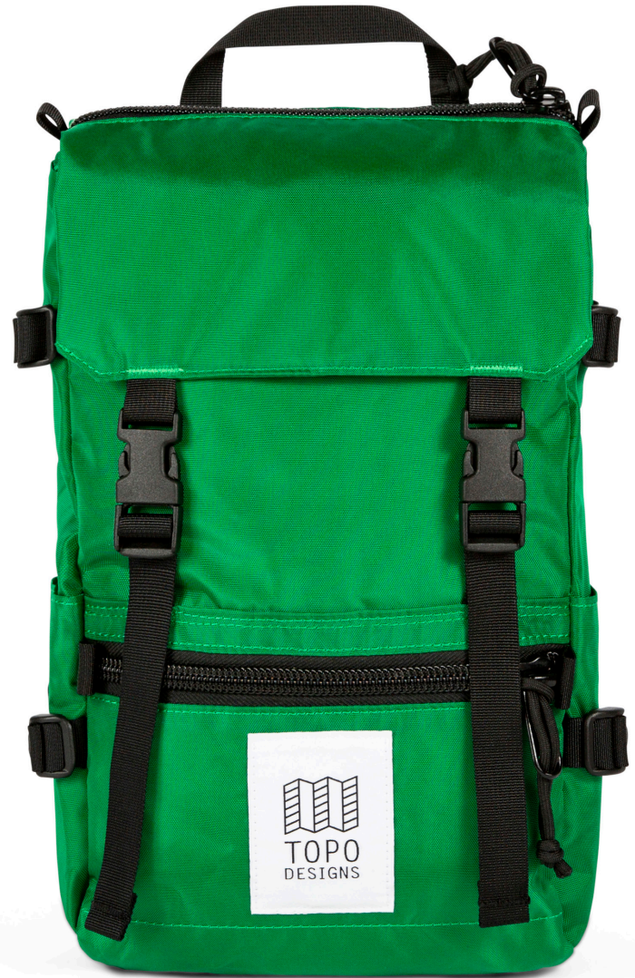
ROVER PACK - GREEN / GREEN