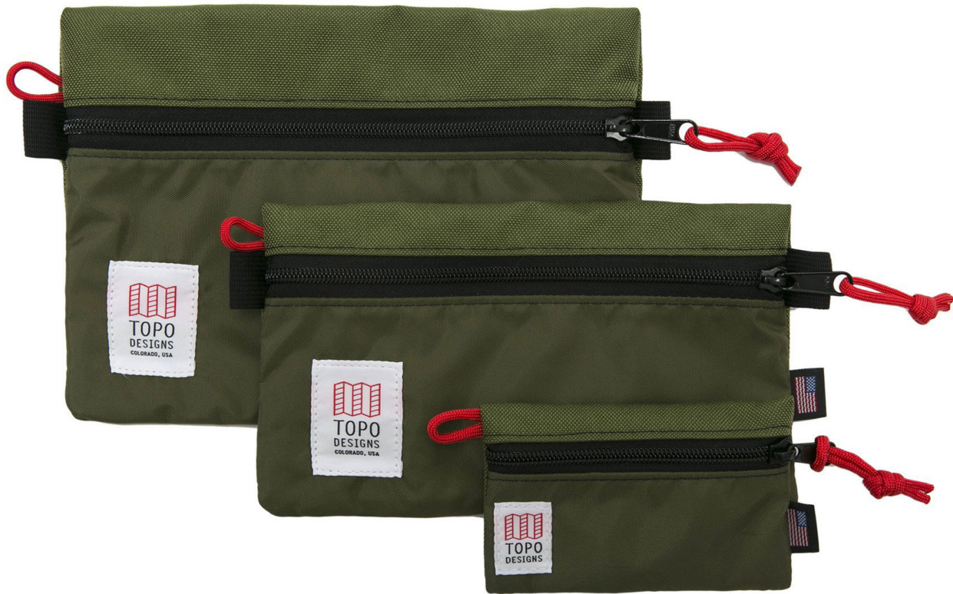
ACCESSORY BAGS - OLIVE * SOLD SEPARATELY