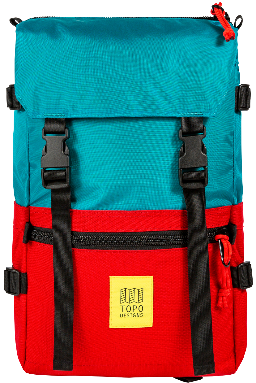
ROVER PACK - TURQUOISE / RED