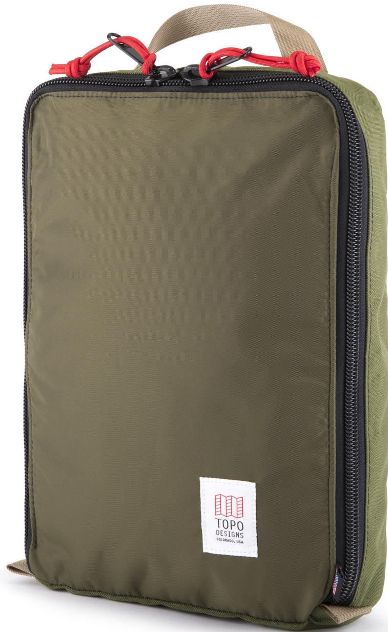
PACK BAG - 10L