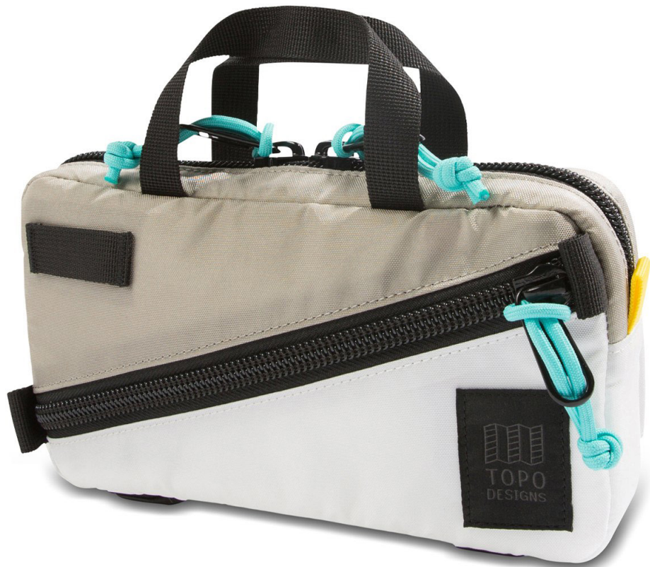
MINI QUICK PACK - SILVER/WHITE