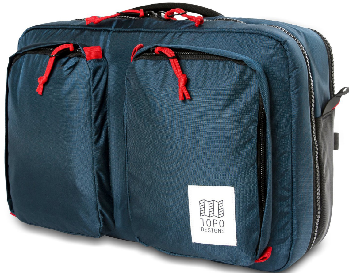
GLOBAL BRIEFCASE - 3-DAY - NAVY