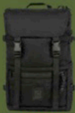
Rover Pack TECH