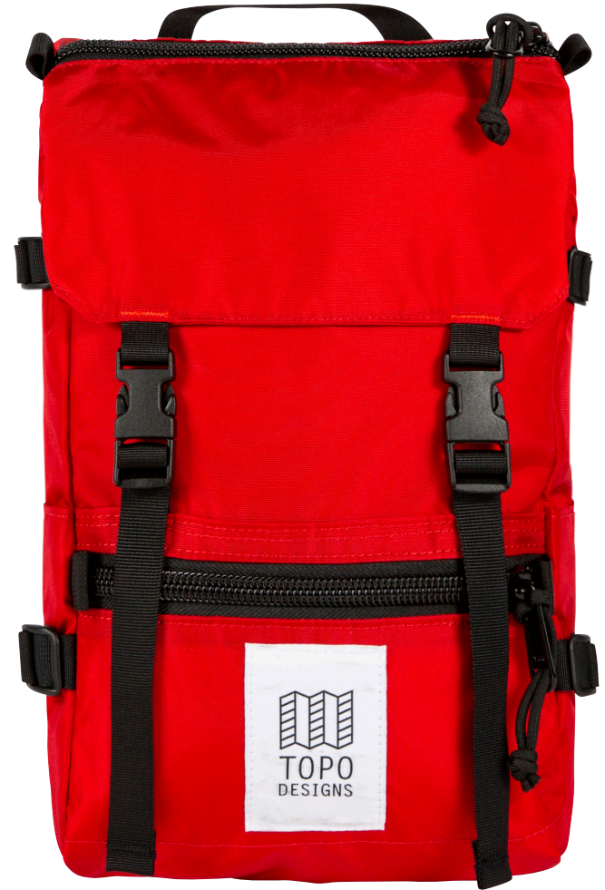
ROVER PACK - RED / RED