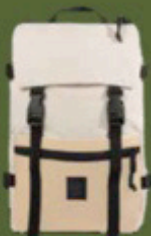
Rover Pack HERITAGE