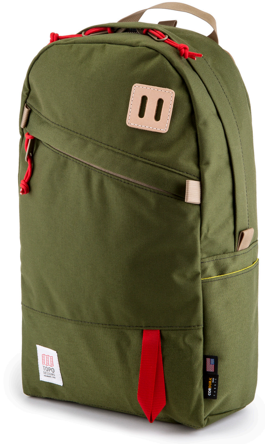
DAY PACK - OLIVE