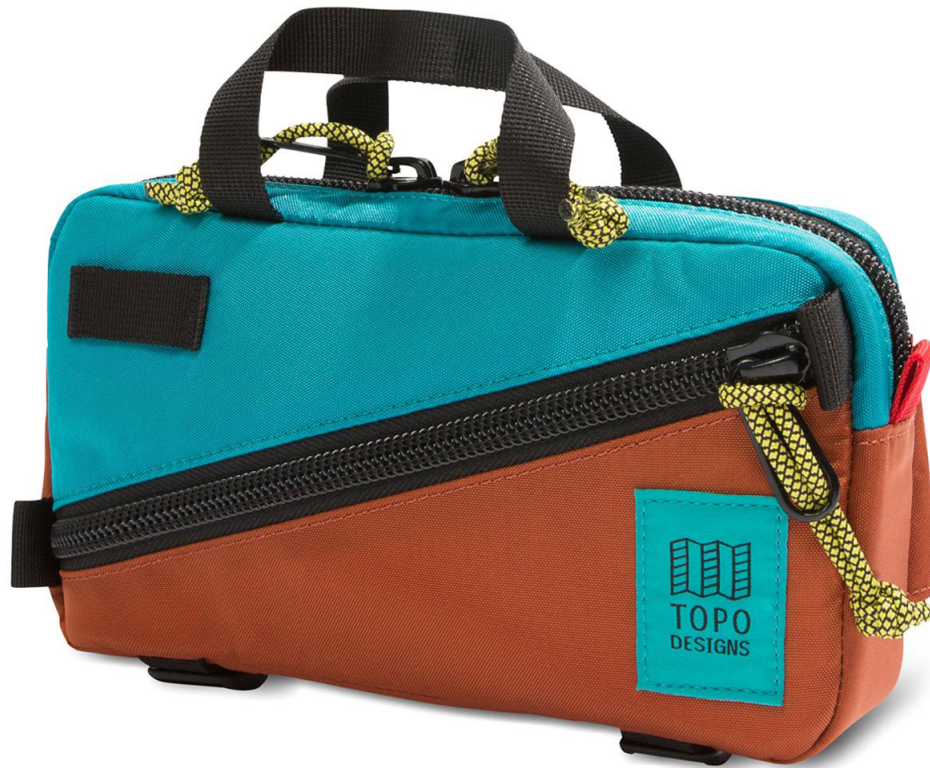
MINI QUICK PACK - TURQUOISE/CLAY