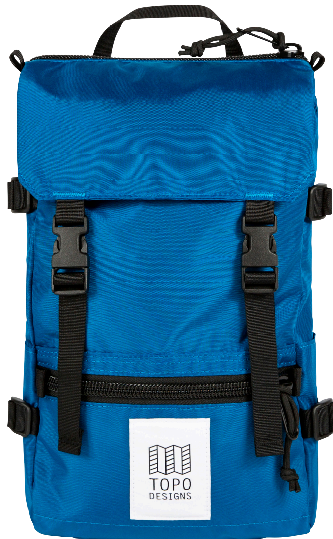
ROVER PACK - BLUE / BLUE