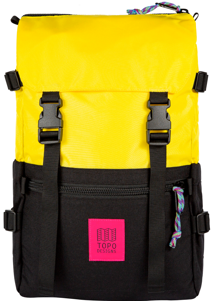
ROVER PACK - YELLOW / BLACK