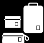
PackFast™ TRAVEL SYSTEM

Our PackFast™ Travel System is a unique combination of accessories and features specifically designed to optimize your travel experience. Our Pack Bags, Dopp Kits and Accessory Bags nest perfectly in both sizes of Travel Bags for a space-efficient, time-saving packing experience, while our travel-friendly PackFast™ Packing Band allows you to easily pack, stow and carry your favorite travel-friendly apparel.