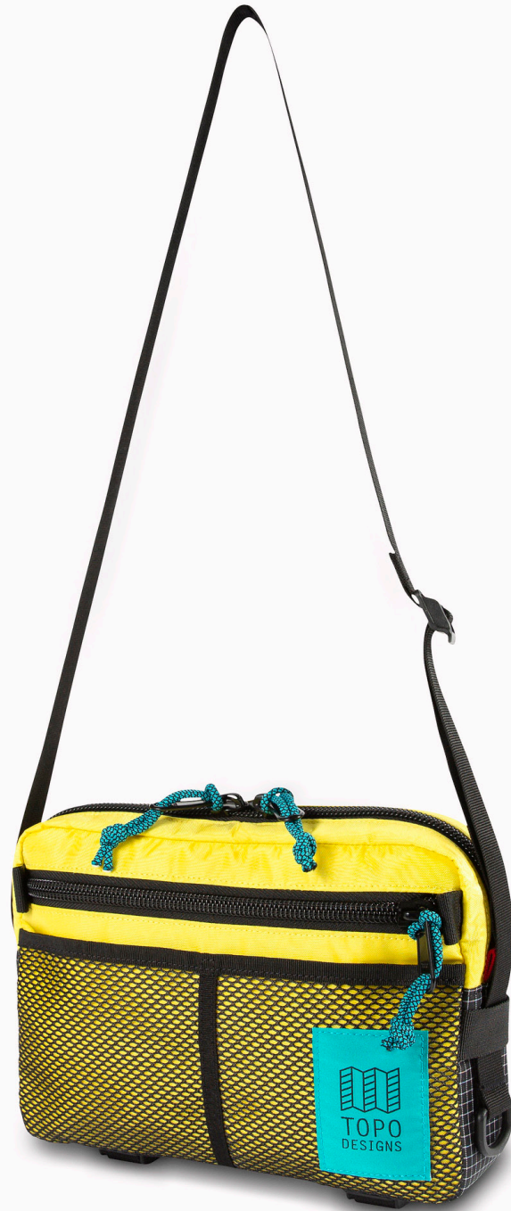
BLOCK BAG - YELLOW