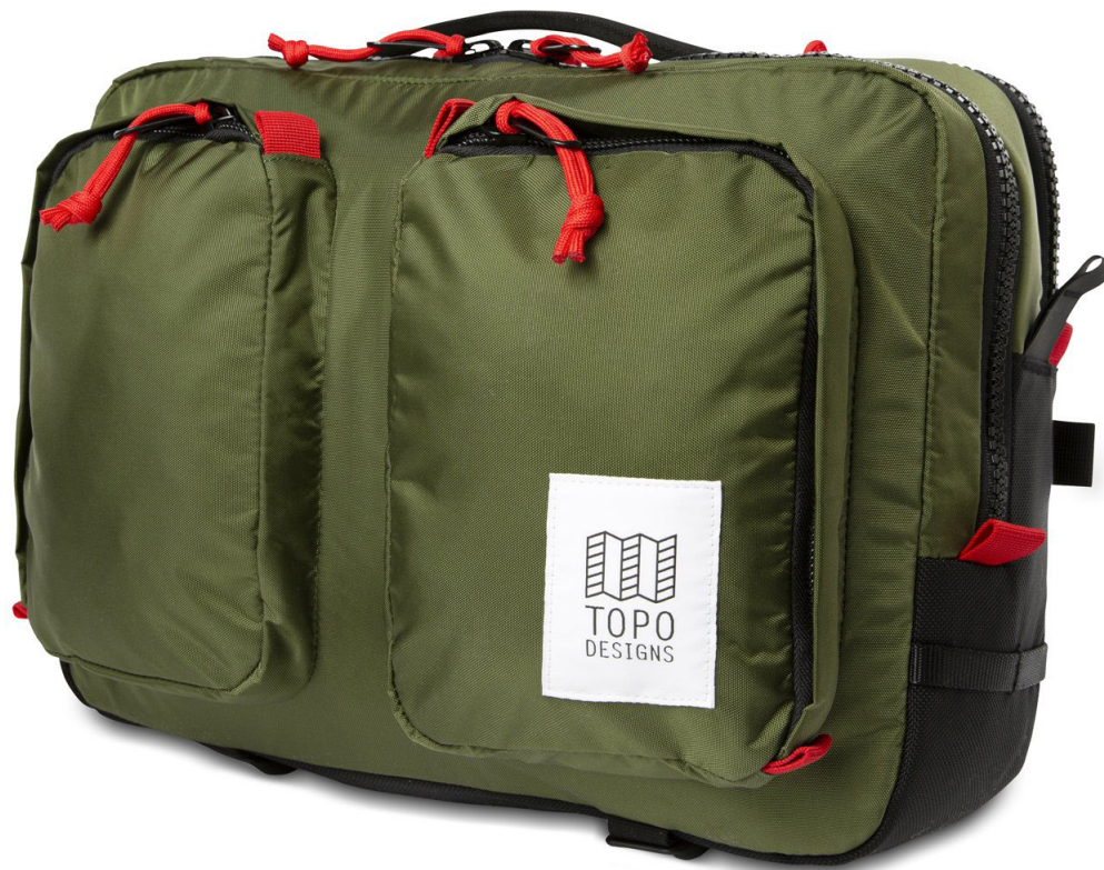
GLOBAL BRIEFCASE - OLIVE