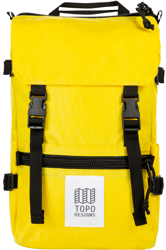
ROVER PACK - YELLOW / YELLOW