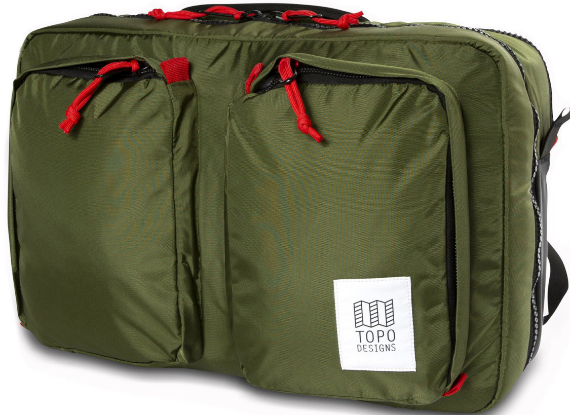
GLOBAL BRIEFCASE - 3-DAY - OLIVE