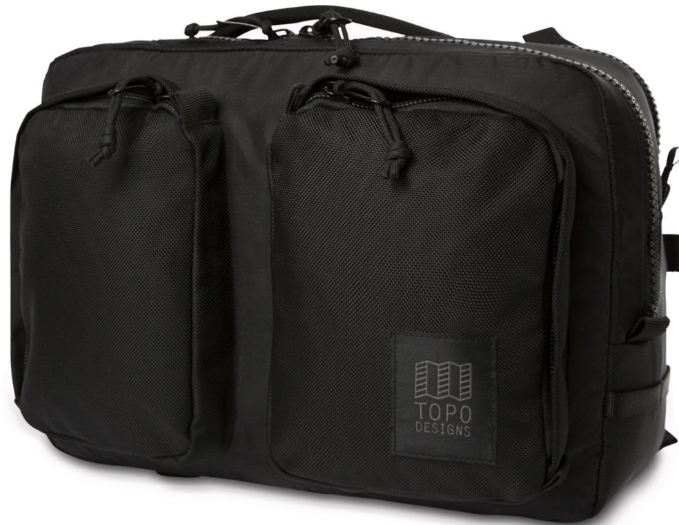
GLOBAL BRIEFCASE - BALLISTIC BLACK