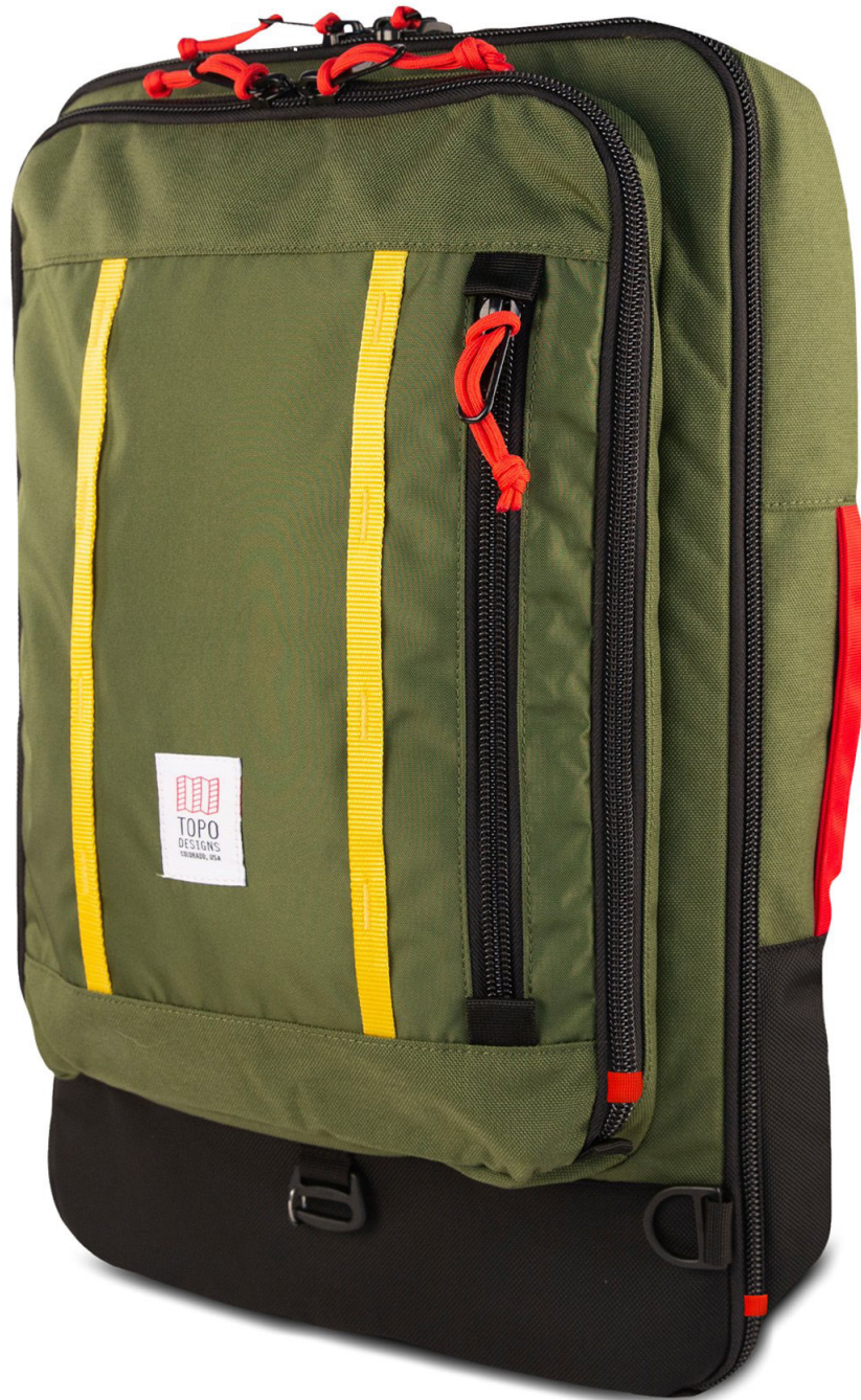
TRAVEL BAG - 40L - OLIVE/RED