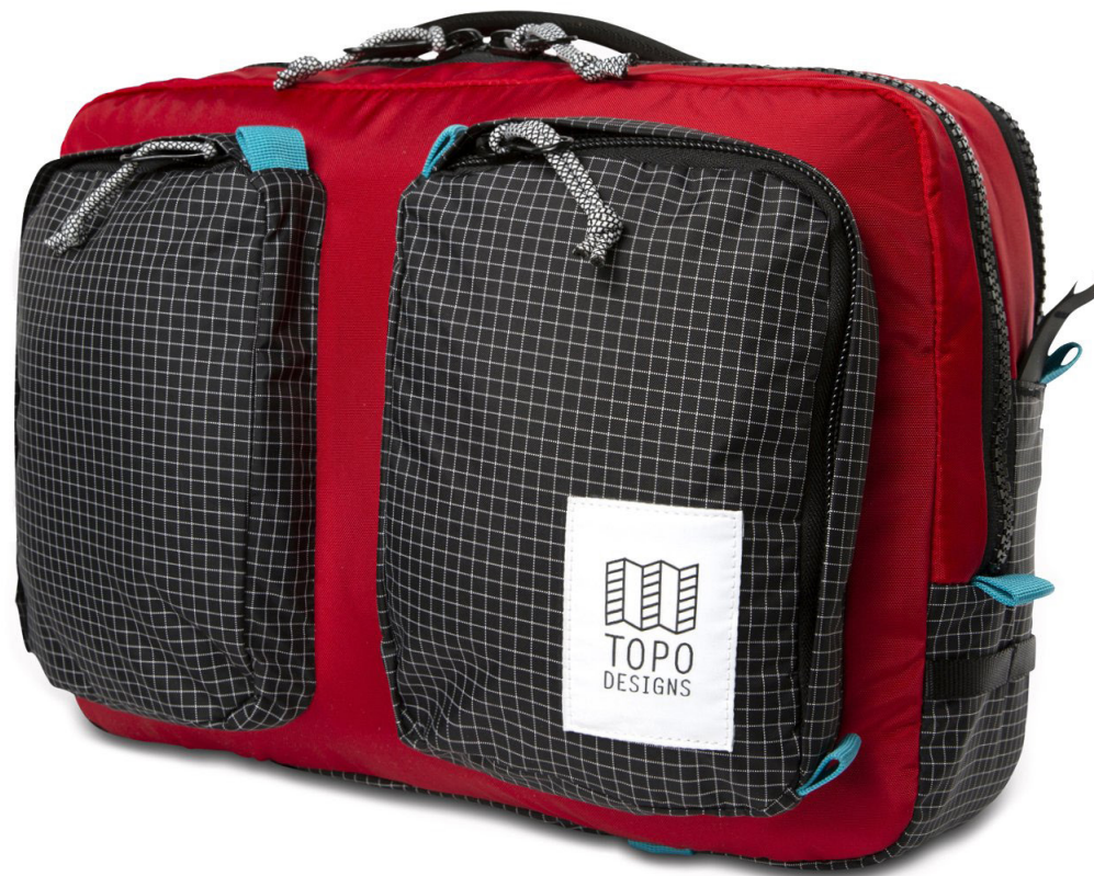
GLOBAL BRIEFCASE - RED/BLACK RIPSTOP