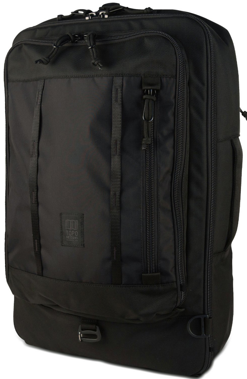
TRAVEL BAG - 30L - BALLISTIC BLACK