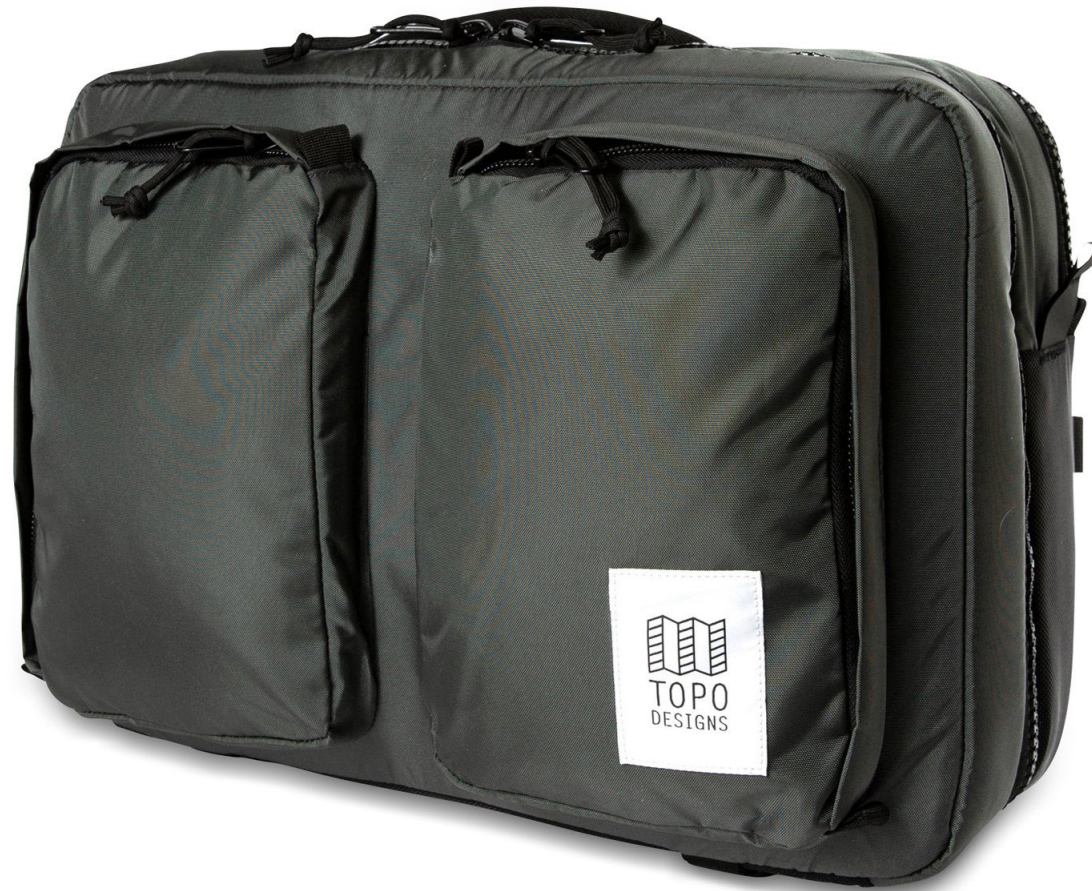
GLOBAL BRIEFCASE - 3-DAY - CHARCOAL