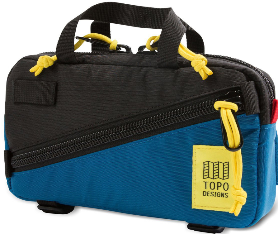
MINI QUICK PACK - BLACK/BLUE