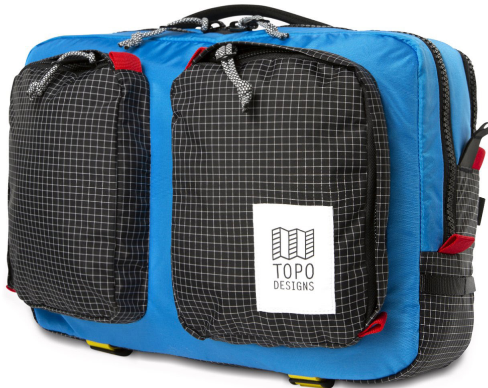
GLOBAL BRIEFCASE - BLUE/BLACK RIPSTOP