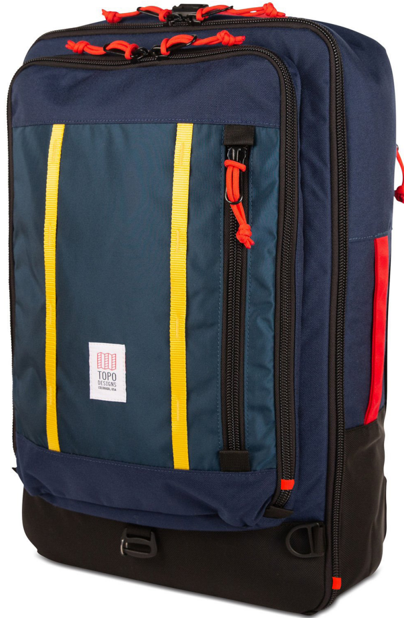
TRAVEL BAG - 30L - NAVY/RED