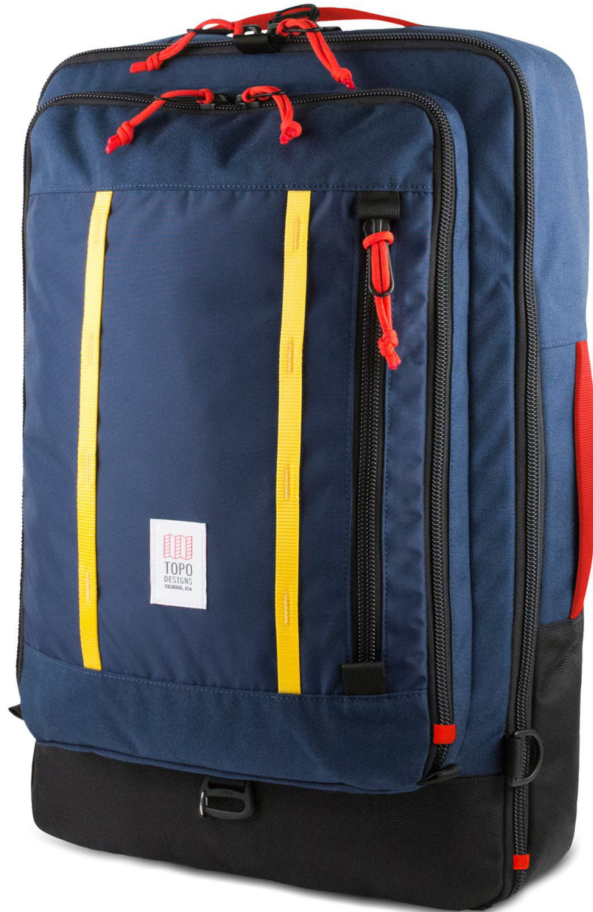
TRAVEL BAG - 40L - NAVY/RED