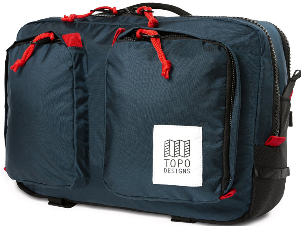
GLOBAL BRIEFCASE - NAVY