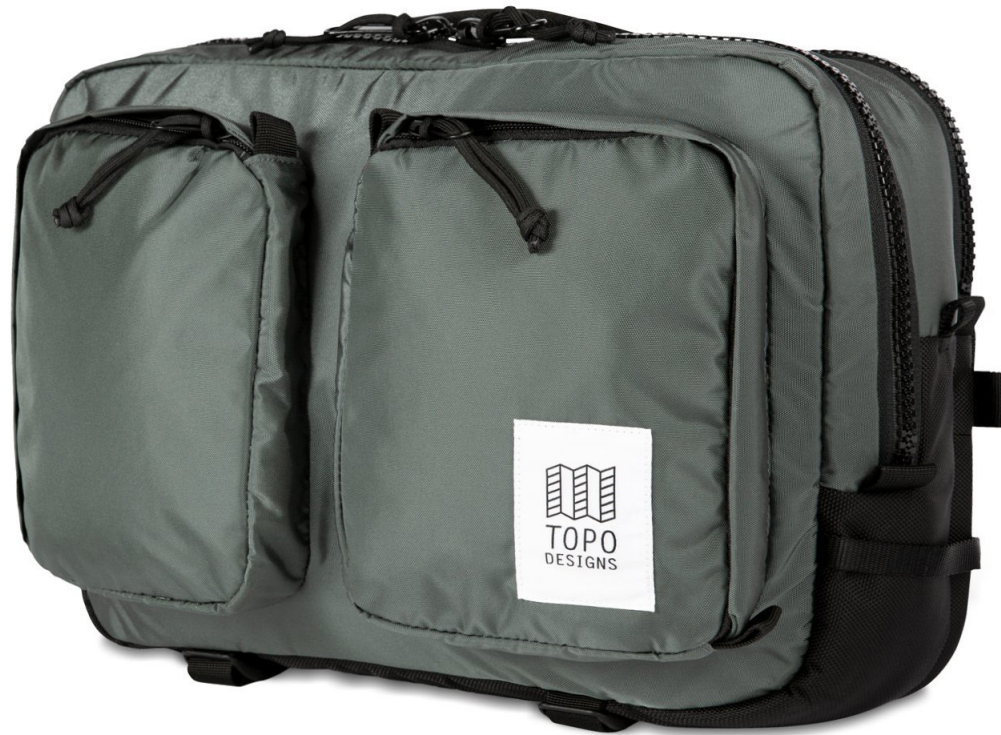
GLOBAL BRIEFCASE - CHARCOAL