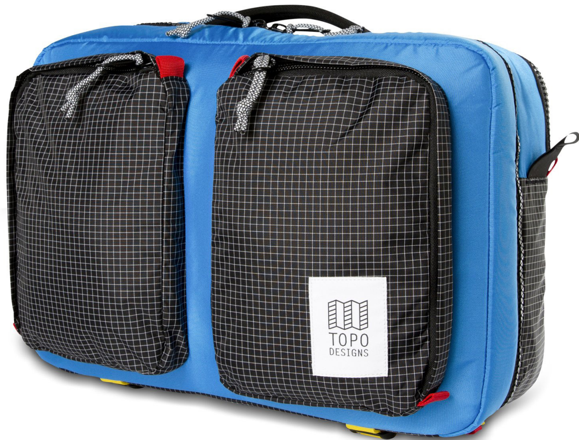
GLOBAL BRIEFCASE - 3-DAY - BLUE/BLACK RIPSTOP