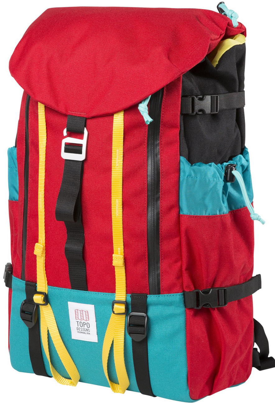
MOUNTAIN PACK - RED