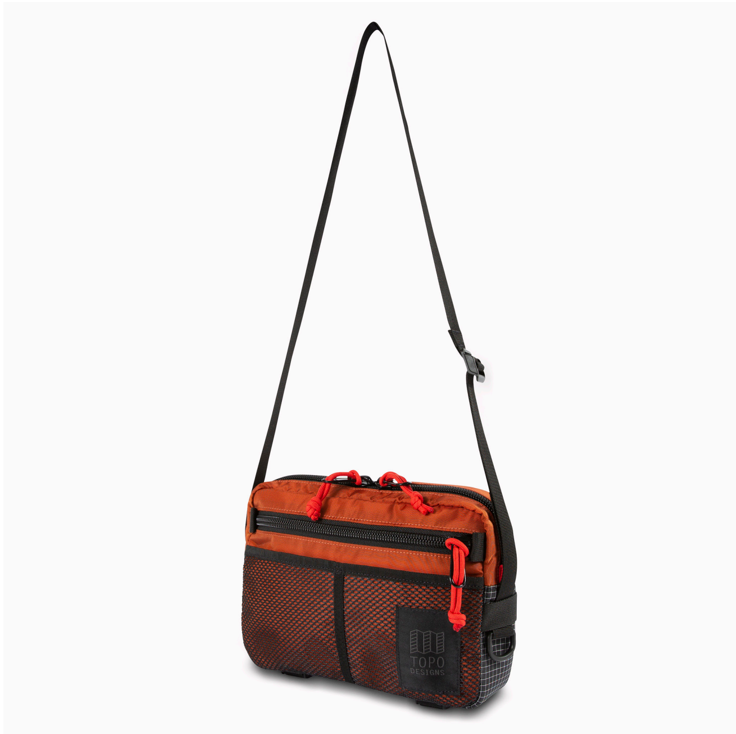
BLOCK BAG - CLAY